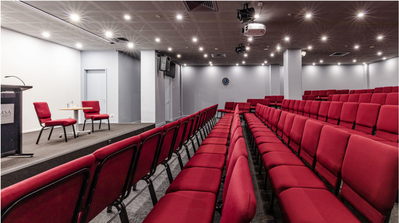
^ PICTURED ABOVE: The newly refurbished Henry Carmichael Theatre.