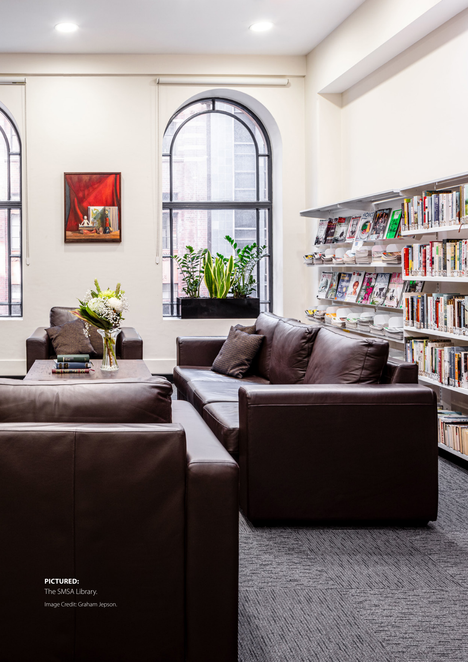
PICTURED: The SMSA Library.